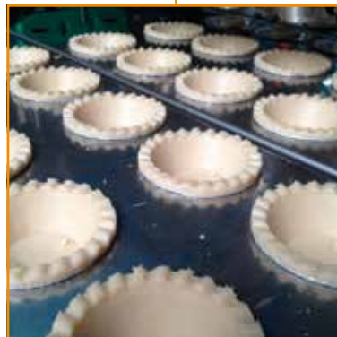
scrapless bottom dough system