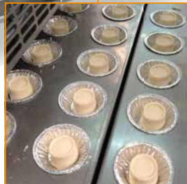
our billet depositor has an accuracy of +/- 1 gram