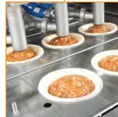
servo depositing is 30% more accurate than pneumatic systems