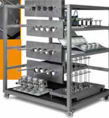
each change set comes with it's own trolley